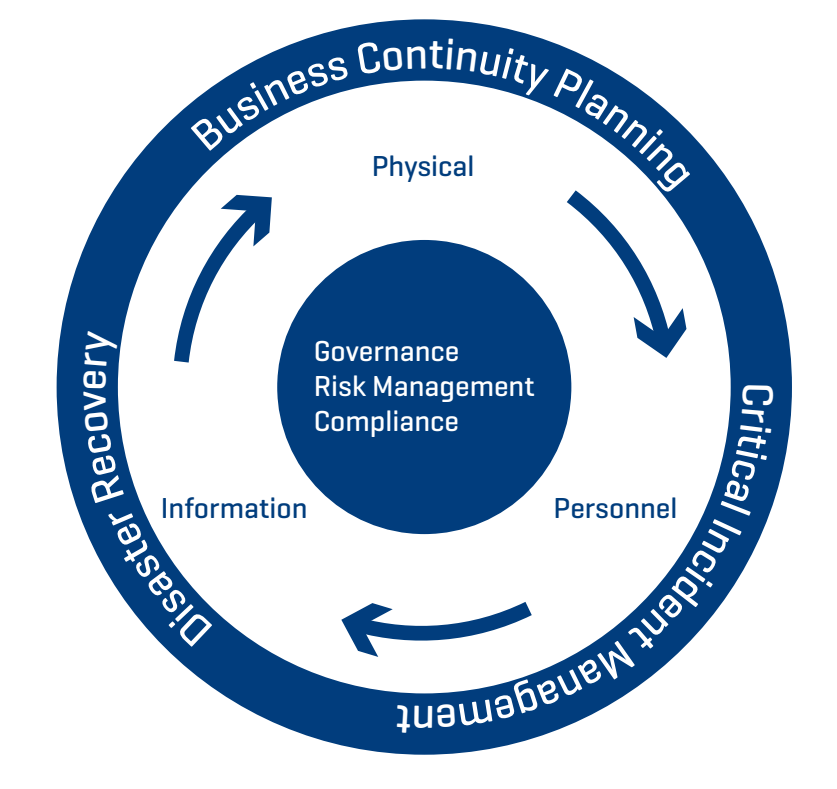
Figure 1. Holistic Risk Management Framework

"...A risk management process to protect assets (i.e. people, information, infrastructure and facilities) and services appropriately, proportionate to threats and in a way that supports (and does not inhibit) business. Physical, technical and procedural controls need to be balanced to achieve an appropriate security approach that meets the needs and circumstances of an organization. These controls should be supported by effective and resilient business processes to respond to, investigate and recover from any incidents."